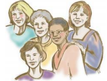
Women of the Church

The WoC will meet on Monday, March 20 th at noon for a covered dish luncheon and business meeting to discuss the future of our rummage sales. We will review the volunteer sign-up sheet to determine if it is feasible to continue. If it is deemed that we can move forward, we will address selection of a firm to haul unsold items away immediately after the sale, along with the hours for the sale, the types of items we will accept, hours of the bag sale and other details associated with the event. All WoC who are available are encouraged to come to this important luncheon meeting.