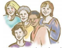
Women of the Church

The WoC will meet on Monday, March 20 th at noon for a covered dish luncheon and business meeting to discuss the future of our rummage sales. We will review the volunteer sign-up sheet to determine if it is feasible to continue. If it is deemed that we can move forward, we will address selection of a firm to haul unsold items away immediately after the sale, along with the hours for the sale, the types of items we will accept, hours of the bag sale and other details associated with the event. All WoC who are available are encouraged to come to this important luncheon meeting.