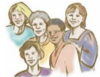
Women of the Church

It is hard to believe that the seasonal wrap is nearing with the approach of summer, so we will be looking to hold our annual WoC picnic on June 7 th . I will be hosting it at my home once again, however, I am open to any ideas of the group. Please let me know your thoughts.