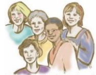
Women of the Church

The next sleeping bag workshop will be on Thursday, May 11 th , at 1:00 p.m. We are getting faster and possibly we can complete two bags this time.