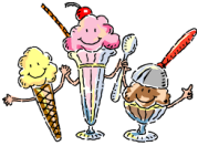
Ice Cream Social

Wednesday, August 16 th , 6:00 PM – 8:00 PM