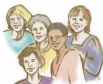
Women of the Church

Due to current COVID restrictions the WoC will not meet in February. We will assess this situation on a month-by-month basis, so please watch the Sunday Bulletin, Epistle and email for future updates. Hopefully, with numbers coming down we will be able to meet soon.