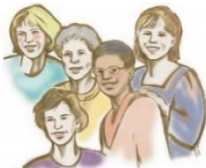
Women of the Church

Since we have not had an opportunity to gather for a number of months, in April we will gather solely for the purpose of enjoying some good food and lots of great conversation. Our luncheon will be on Thursday, April 21 st