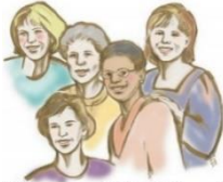
Women of the Church

Since we have not had an opportunity to gather for a number of months, in April we will gather solely for the purpose of enjoying some good food and lots of great conversation. Our luncheon will be on Thursday, April 21 st in the undercroft and we will plan to eat at noon. Please bring a dish to pass. A sign-up sheet is at the back of the church or you may let me know if you are coming by email or phone. Although sign up is not mandatory, it helps us to know how many people to set up for. We will need volunteers to help with set-up and clean-up, which you can note on the sign-up sheet or when you contact me.